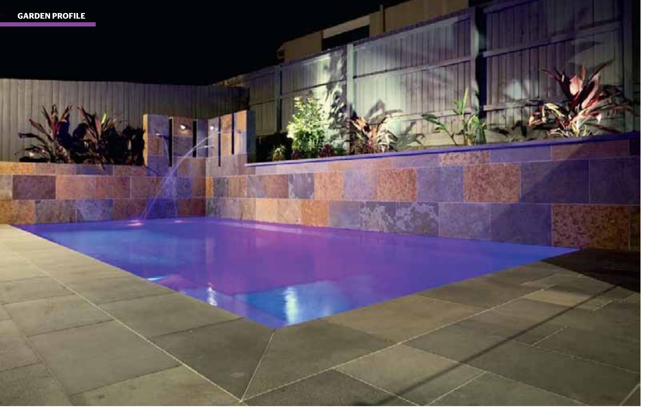
"An enjoyable space to use after dark and to simply look at from inside the home"