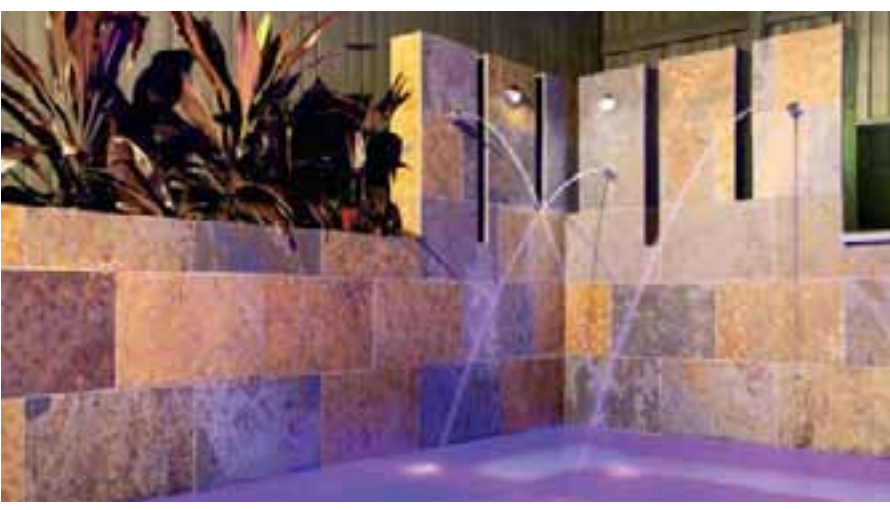
TOP This well-designed project proves you don't need masses of space to accommodate a new pool. ABOVE The water feature was designed to be enjoyed when in the pool or as well as the physical dimensions of the area. Through looking out from inside the house OPPOSITE PAGE TOP Garden and pool lights work in harmony to totally transform the outdoor spaces after nightfall. OPPOSITE PAGE BOTTOM Glass fencing divides the pool from the entertaining deck and ensures the space feels free-flowing.

and to reduce costs, the lawn is surrounded by a timber retaining wall with capping. The wall doubles as seating and has a Sikkens finish and Colorbond infill panels (Woodland Grey colour). The existing timber boundary fence was spruced up with a coat of paint, also in Woodland Grey, which will eventually be "lost" behind plantings of Cordyline 'Negra', Pleomele reflexa, liriope, heliconia and Elaeocarpus eumundii, which will provide a sense of privacy from neighbouring properties.